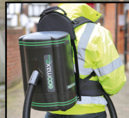
A LIGHTWEIGHT COMFORTABLE BACKPACK