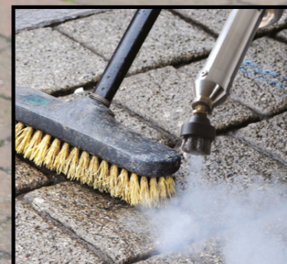
HOT ECO FRIENDLY DETERGENT